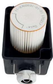
Standard SEC-DFU-911 dust filter unit

The new DFU 911S dust filter unit is equipped with a special protective flap. Additional monitoring is made as to whether a filter cartridge is inserted or not. If the filter cartridge is missing, an air flow fault is triggered on the ASD. This is a fast and effective way of determining whether the filter cartridge was deliberately removed or accidentally not inserted. While the filter cartridge is being replaced, the flap also prevents dirt from entering the sampling pipe.