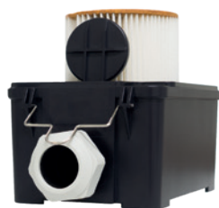
DFU 911S dust filter unit with integrated protective flap